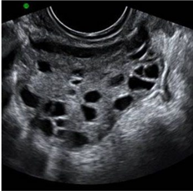
Figure 2: Multiple cysts in a patient with polycystic ovary syndrome

Most patients with PCOS have more than 12 cysts, usually peripherally located, as in the figure.